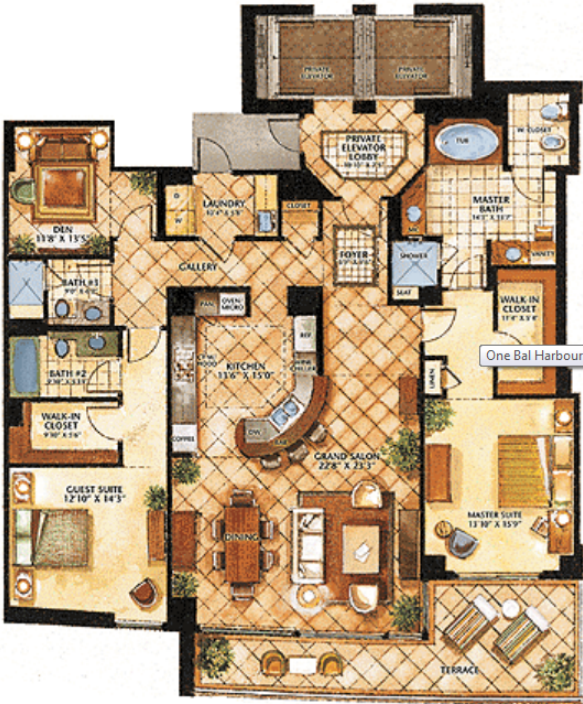
One Bal Harbour Residence D Floor Plan

INTERIOR AREA.....2,229 SQ. FT. TERRACE AREA.....205 SQ. FT. TOTAL AREA.....2,434 SQ. FT.